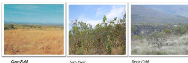
Figure 2. Grassland formations in the Brazilian Cerrado. Sources: [12], [13].

The vegetation included in the grassland formations comprises areas of Clean Field, Dirty Field and Rocky Field (Figure 2). Regions of Dirty Field and Rocky Field present a physiognomic type predominantly herbaceous and shrubby. However, Rocky Field areas include micro-relief landscapes with typical species, which usually occupy regions of rocky outcrops at elevations above 900 m. On the other hand, the phytogeography of Clean Field has a predominance of grasses interspersed with underdeveloped woody plants, without the presence of trees [5].