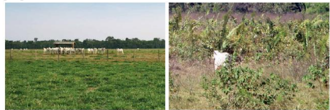
Figure 3. Examples of managed (left) and degraded pastures (right).

Cultivated pastures represent about 500,000 km 2 of the biome. It is important to analyze the degradation of cultivated pastures, since nearly 50% of the planted areas in grasslands are severely degraded (Figure 3), causing increased erosion, loss of soil fertility and the predominance of invasive species [16]. Therefore, not only can the recovery of these areas increase the producers' income, but also it can reduce the environmental impact by decreasing erosion, emission of carbon dioxide and opening new areas for cattle [17].